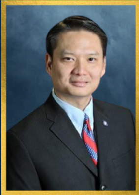
Tri Ta Mayor