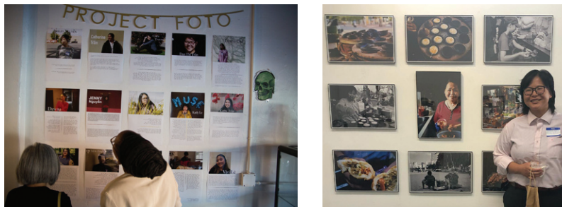
Gallery Beyond Walls workshop

Goal: Encourage students to think about and capture what they interpret as representing their community (i.e., their family, neighborhood, sites).