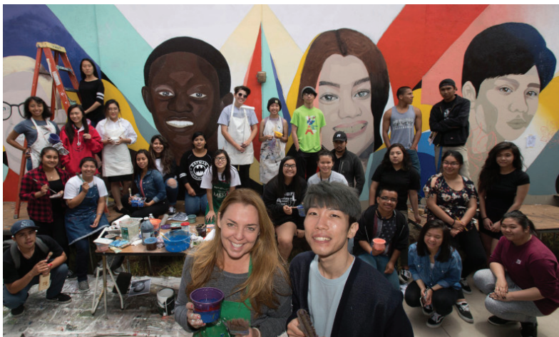
Westminster High School mural project led by arts teacher and visiting artist

Aside from informing the design of the Westminster Crossing murals, the workshops are intended to empower youth with technical and creative skills such as critical reflection and writing, observation and photography, and communication and creativity. Tiffany and James have led similar workshops as part of VAALA's Gallery Beyond Walls program.