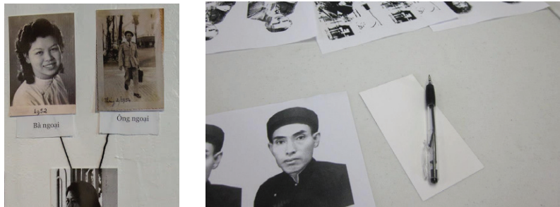
Gallery Beyond Walls workshop

Goal: Foster communication and connection between youth and older generations.