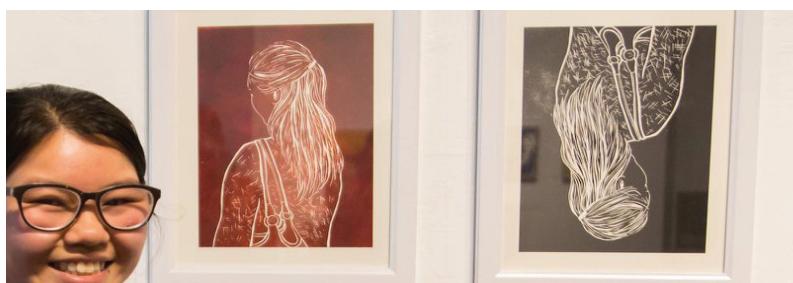
Gallery Beyond Walls workshop

Goal: Use art as a powerful tool for communication.