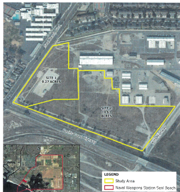
Aerial view of the proposed Site 1 and Site 2 from NWSSB, looking south.

The Environmental Assessment will focus on resource areas that may potentially be impacted. The public is encouraged to provide input on these and other resource areas: Land use and coastal zone management; traffic and circulation; visual resources; biological resources; utilities; noise; cultural resources; topography, geology, and soils; air quality; water resources; and environmental justice/socioeconomics.